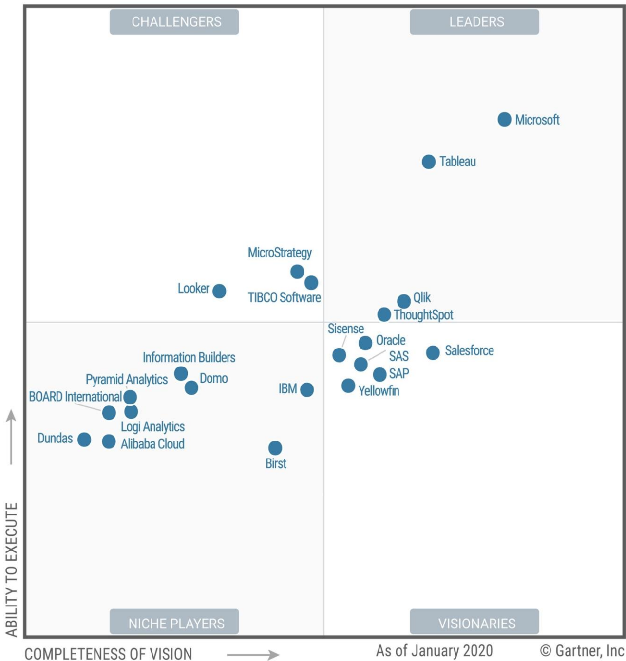
Figure 1. Magic Quadrant for Analytics and Business Intelligence Platforms